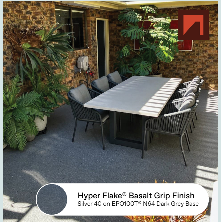
Hyper Flake® Basalt Grip Finish Silver 40 on EPO100T® N64 Dark Grey Base