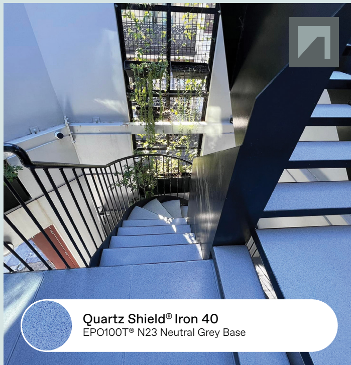
Quartz Shield® Iron 40 EPO100T® N23 Neutral Grey Base