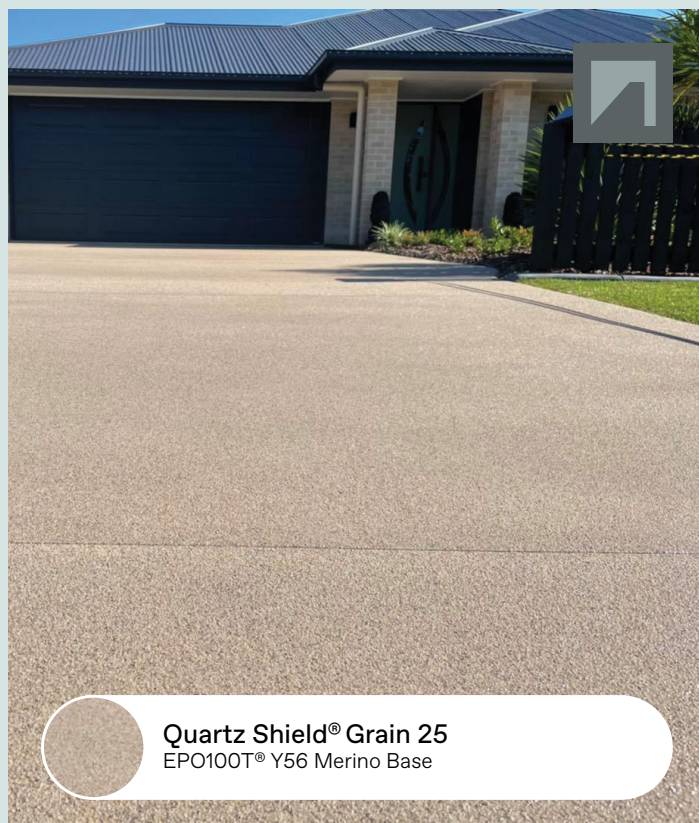
Quartz Shield® Grain 25 EPO100T® Y56 Merino Base